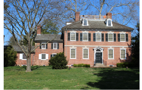
The Corbit-Sharp house - one of fourteen National Historic Landmarks in Delaware

The Historic Odessa Foundation is known for its collection of outstanding 18th century houses. The Corbit-Sharp House is one of only fourteen National Historic Landmarks in Delaware. In fact the whole town of Odessa is on the National Historic Register. Whether your house is old or new, big or small; it is your home and deserves to be documented. The drawing to be used as inspiration was drawn by Cantwell's Bridge (the name of the town of Odessa at the time) resident George Washington Janvier around 1805. The ink and watercolor drawing, in the HOF collection, is believed to depict the Captain James Moore house of 1773. The historic home is called Fairview, and is located just across the Appoquinimink River from town.