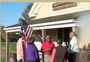
Bucktown Village Store, MD