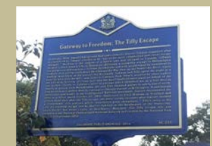
Gateway Park, Seaford, DE