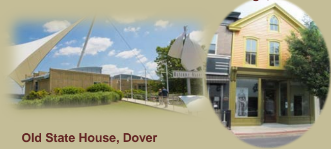
Old State House, Dover