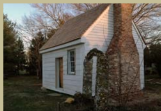
Webb Cabin, Preston, MD